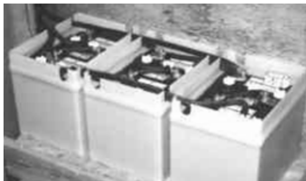
A 3-cell configuration of deep-cycle batteries, installed for a typical Solar PV System.